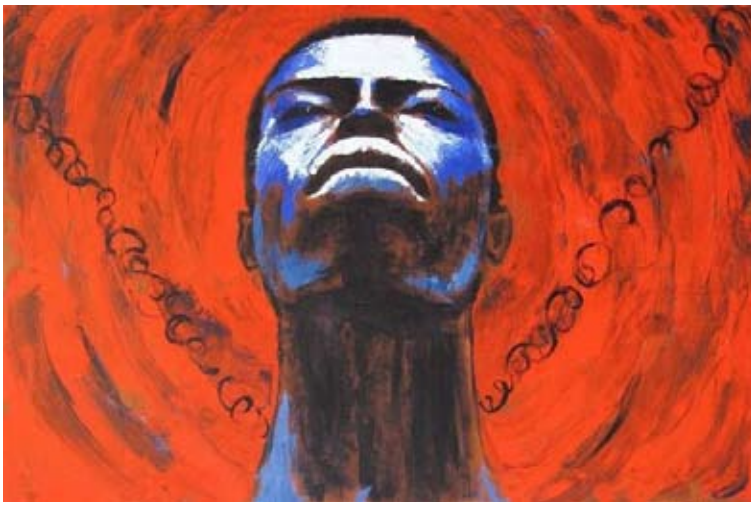
Work like “Red Days and Blue Knights” distinguishes the artist as a “very steady, creative force,” in one teacher’s view.

“You are your own convenient model; so I tend to come out most in my paintings.”